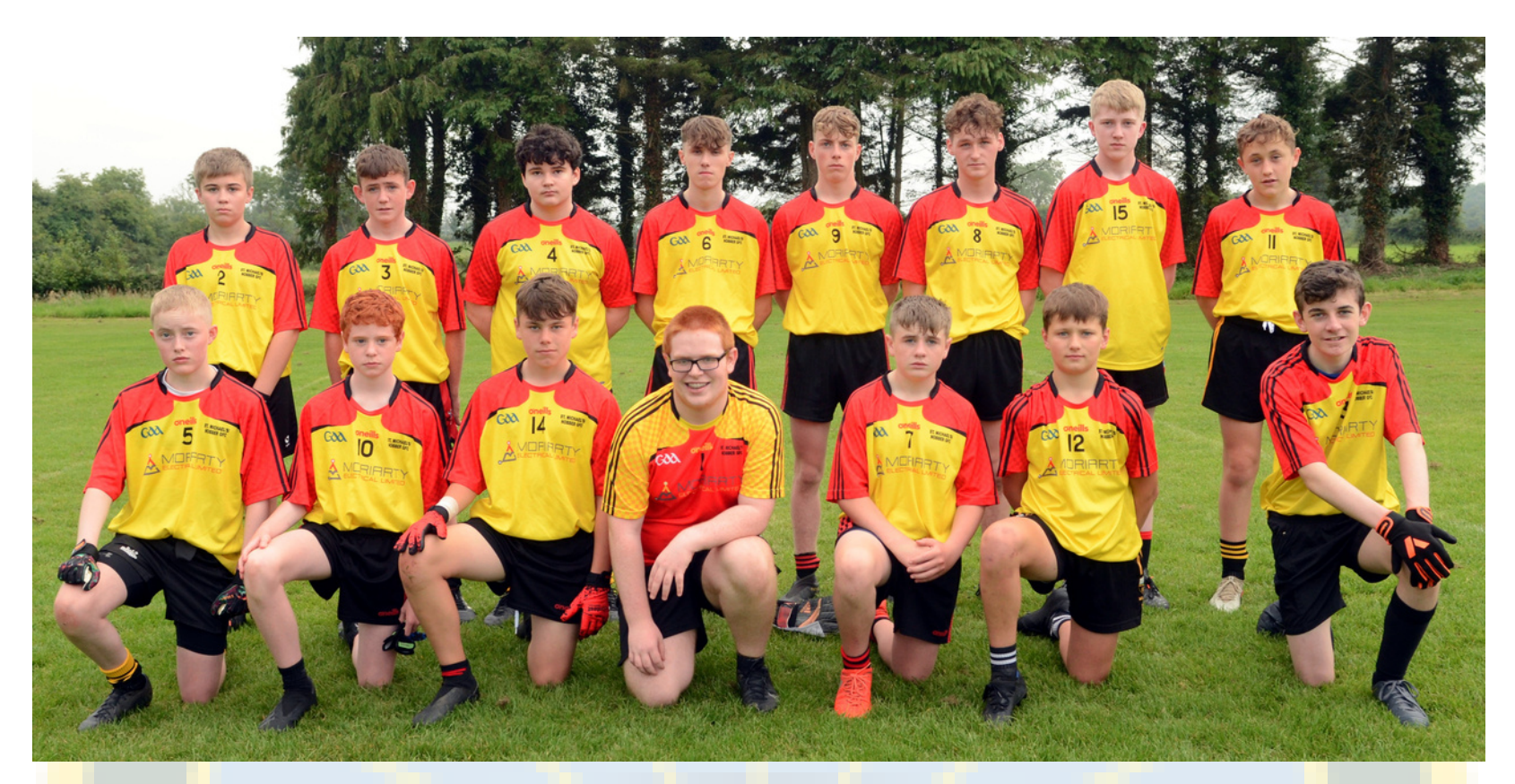
The 2020 U15 footballers of St Michael's/Nobber