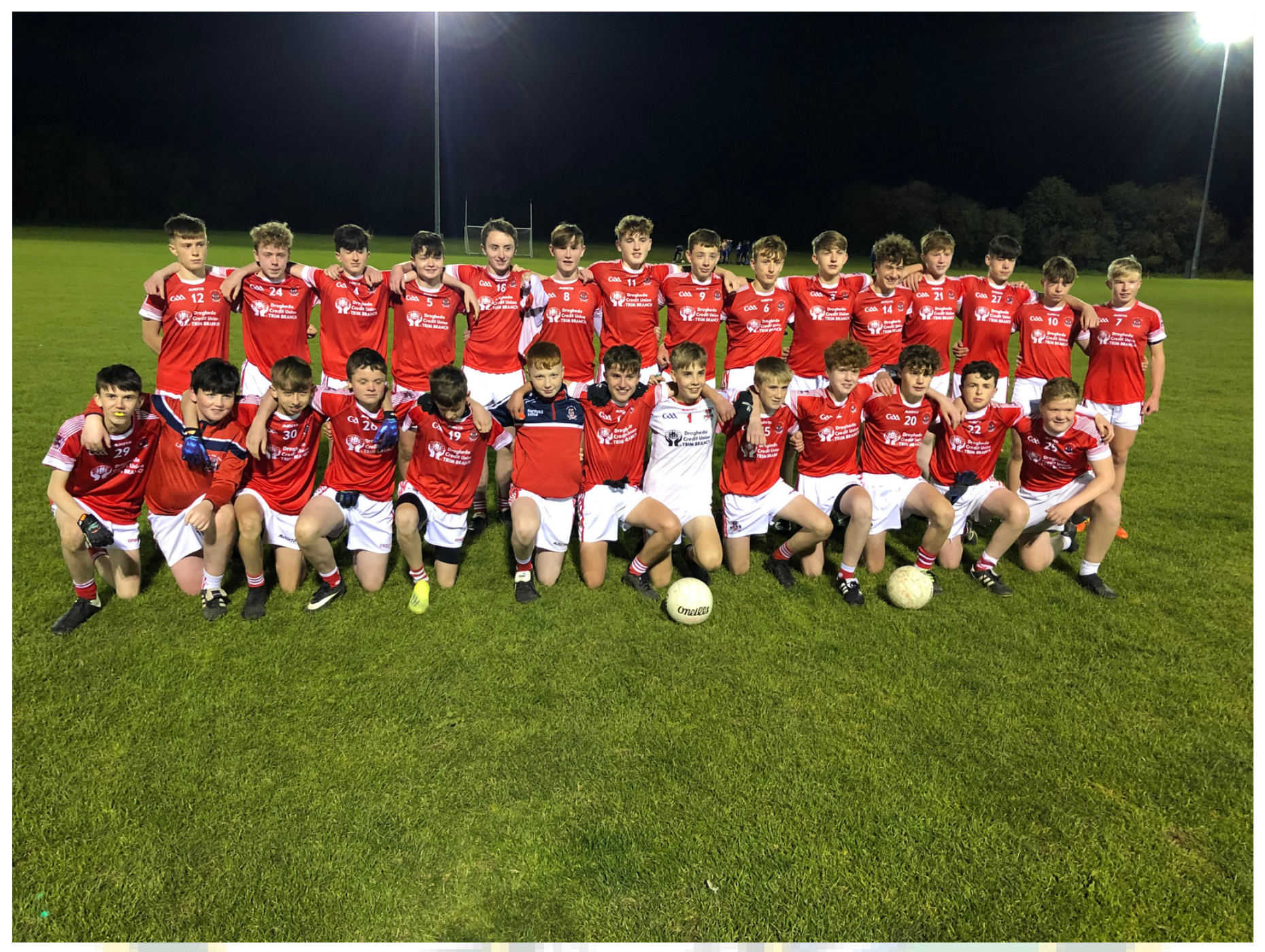
The 2020 U15 footballers from Trim