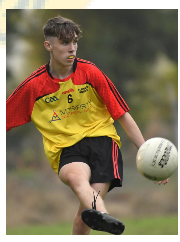
Digital programme produced by Coiste Mionúir an Mhí C.L.G.