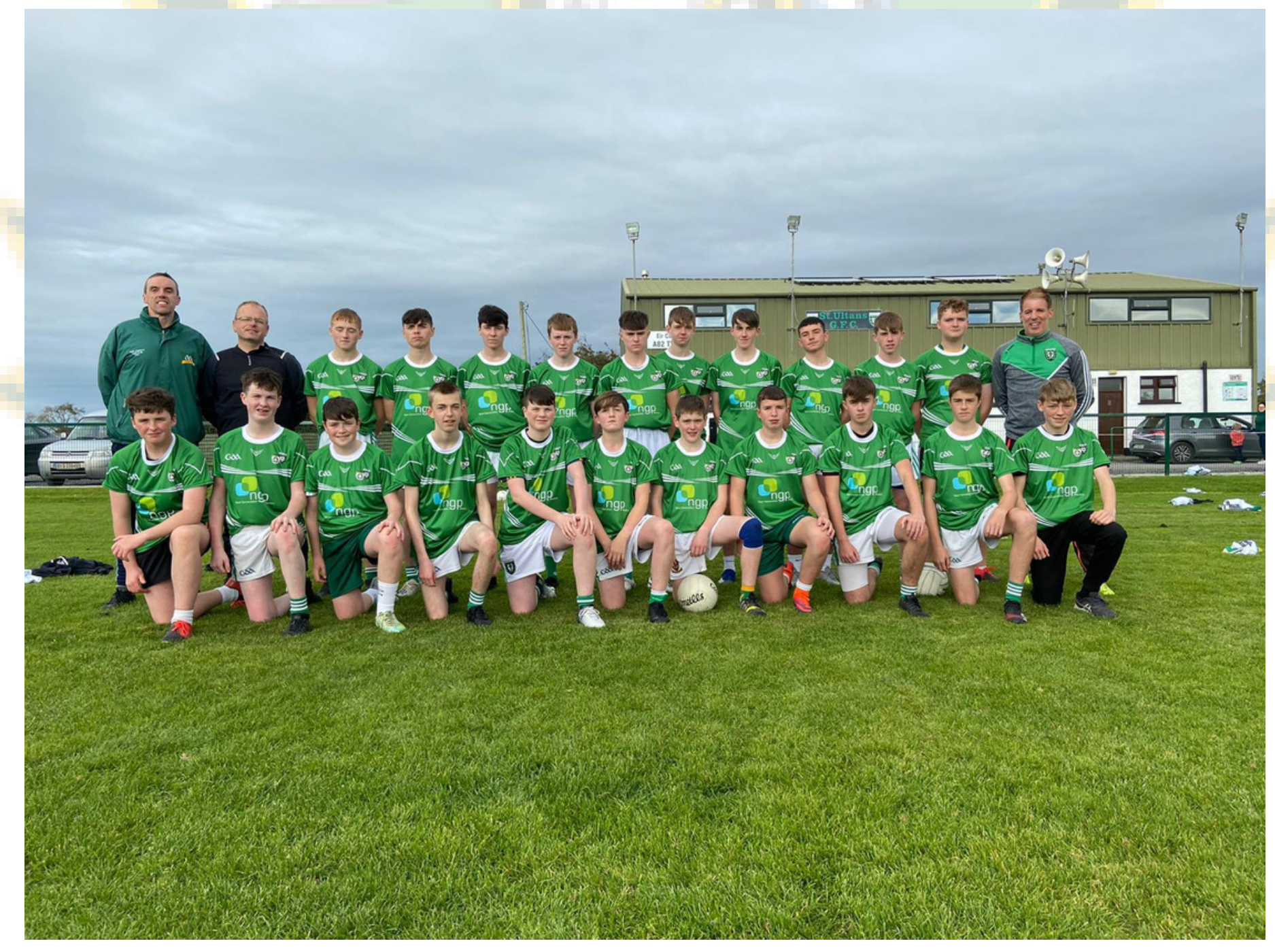
The 2020 U15 footballers from St Ultan's/Cortown Gaels