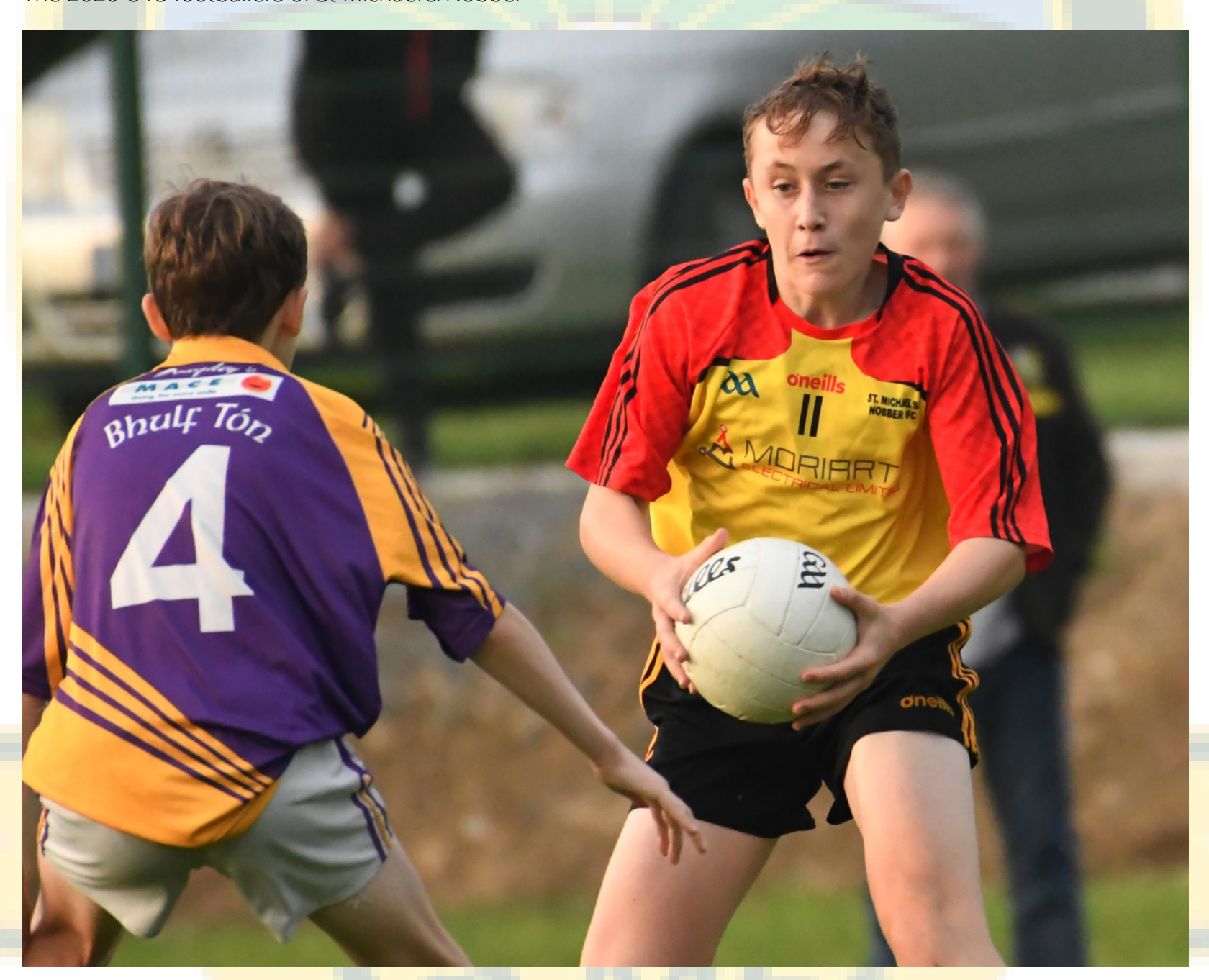
St Michael's/Nobber in action.