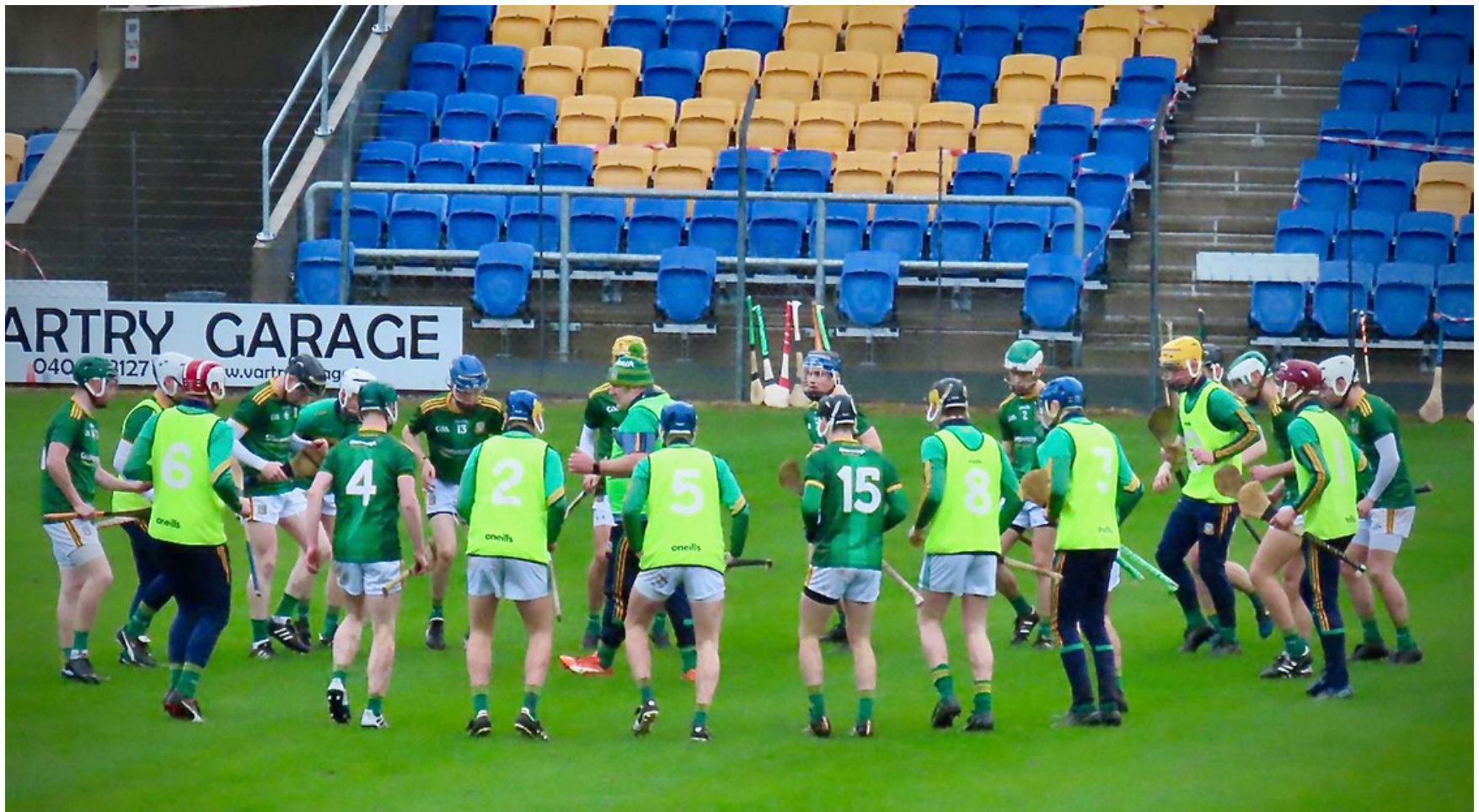
The Meath Minor hurlers warm up for their meeting with Wicklow in Augnrim last Sunday afternoon.