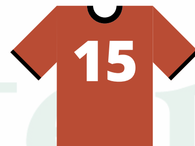
Oisín Coulter Baile Mhic Uileagoid