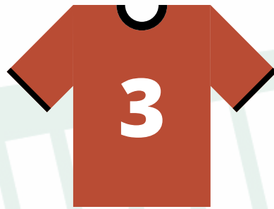
Deaglan Mallon Port an Pheire