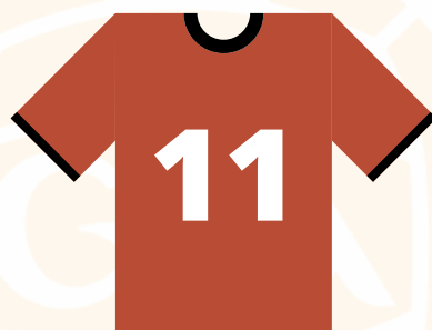
Tom McGrattan (C) Port an Pheire