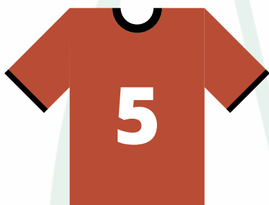
Finn Turpin Port an Pheire