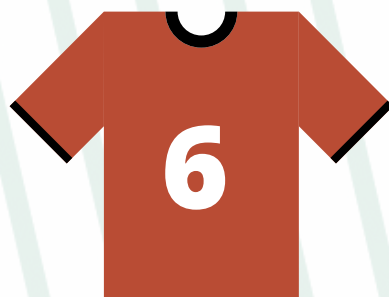
Ciaran Savage Port an Pheire