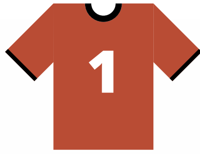
Pearse Smyth Port an Pheire