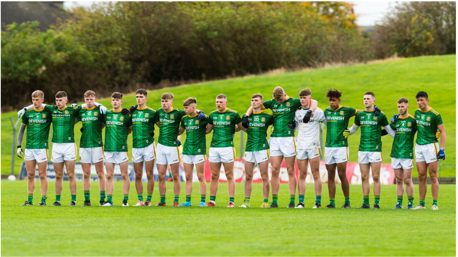
The Meath Minor footballers line out for the National Anthem ahead of their first round meeting with Dublin.