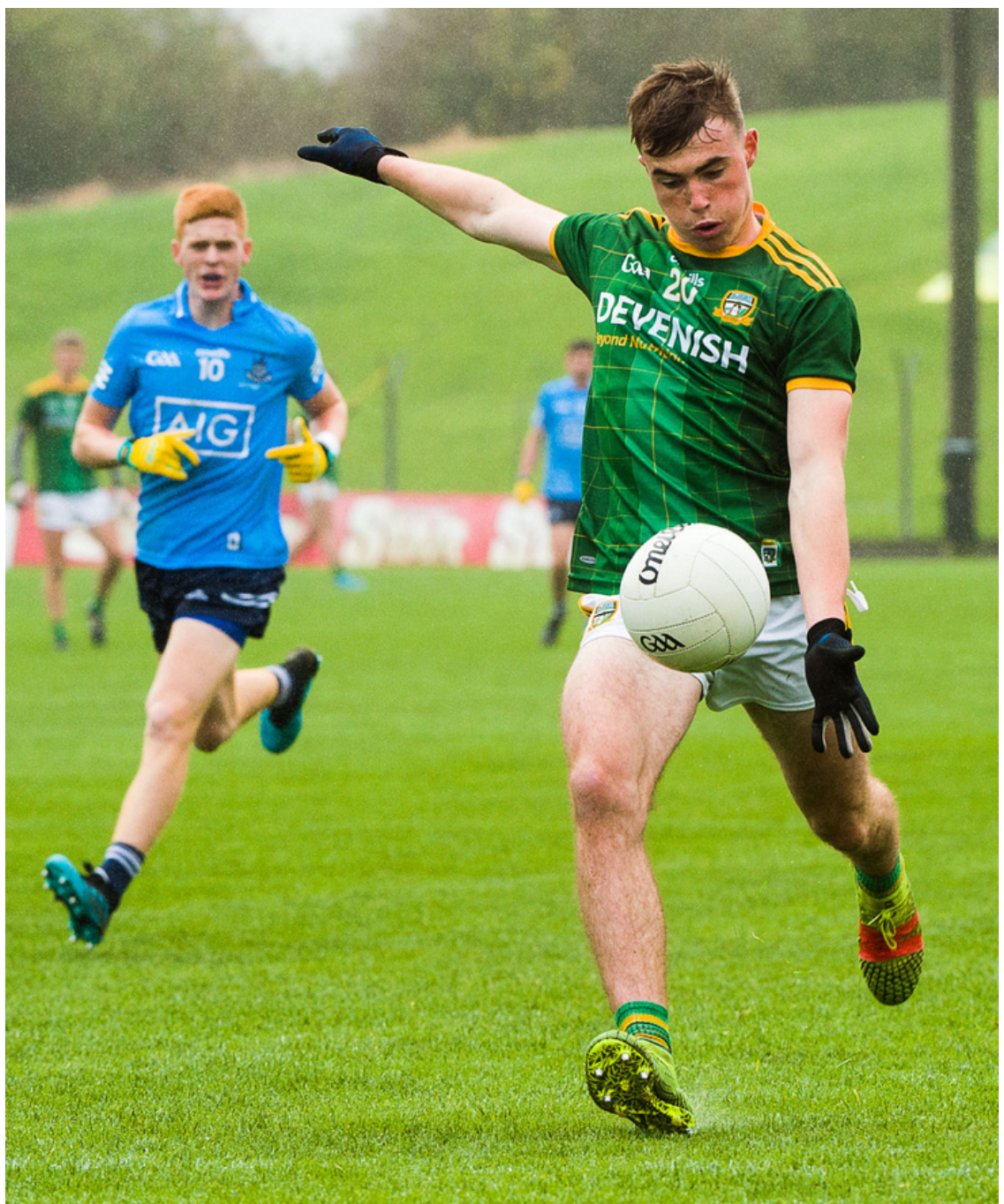
Action from Meath's victory over Dublin in Navan back in October.