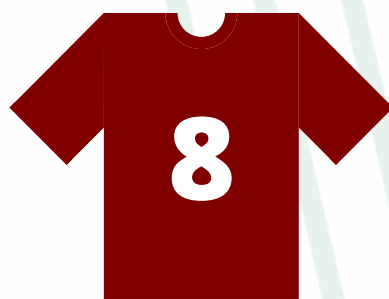
Tobi Conteh Móta Uile Bána