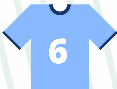
Dáire O'Rourke Raibíní Fine Ghall