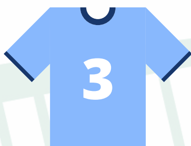
Theo Clancy Cill Mochuda Na Crócaigh