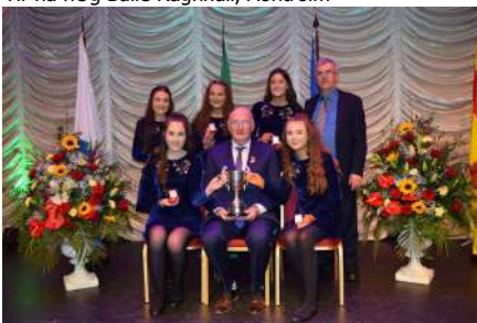
BAILÉAD GHRÚPA: CONNACHTA Naomh Muire, Liatroim