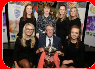
ST.JAMES in Bailéad Ghrúpa