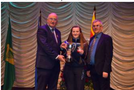
AITHRÍSEOIREACHT/SCEALAÍOCHT: ULAIDH Tír na nÓg Baile Raghnaill, Aontroim