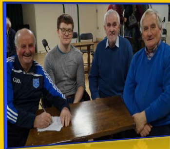
TRÁTH NA gCEIST BOIRD Creatlach