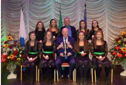
RINCE FOIRNE: ULAIDH Naomh Muire, Achadh Gallon, Aontroim