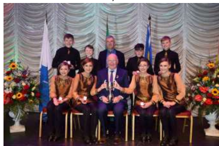
RINCE SEIT: CONNACHTA Mainistir Chnoc Muaidhe, Gaillimh