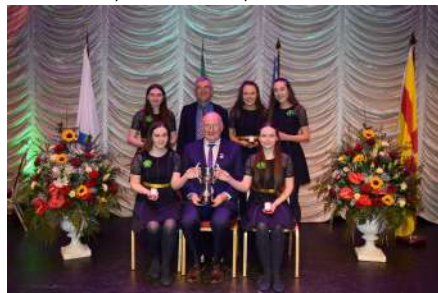
CEOL UIRLISE: LAIGHIN Gill Chormaic—Cill Achaidh, Uíbh Fhailí