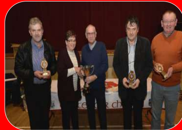
MILLSTREET in the Tráth na gCeistanna Boird

IN THEIR BID FOR GLORY IN TODAY'S ALL IRELAND FINAL