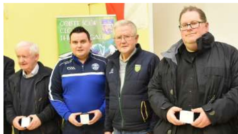
DÚN NA NGALL