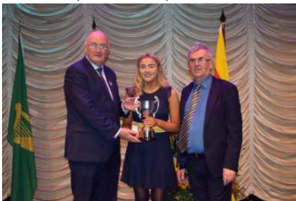
AMHRÁNAÍOCHT AONAIR: ULAIDH Cumann Chluain Daimh, An Dún