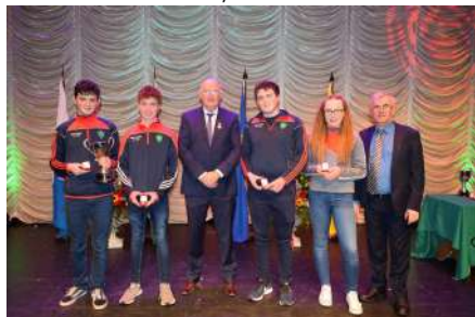
TRÁTH NA GCEISTEANNA BOIRD: ULAIDH Corr na Féinne, an Cabhán