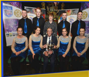
RINCE SEIT Lios Uí Chathasigh