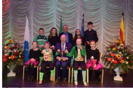
LÉIRIÚ: ULAIDH Naomh Muire, Achadh Gallon, Aontroim