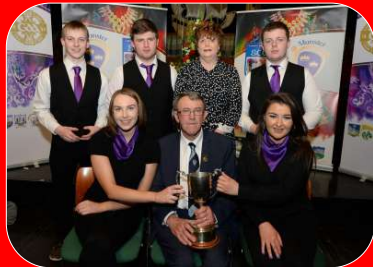
KILSHANNIG in Ceol Uirlise